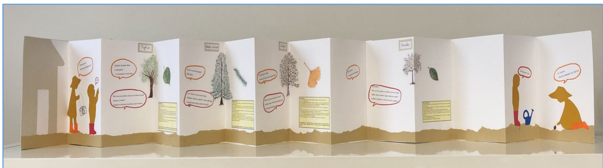
Figures 4a. Project work on trees. Permission was given to share the students' work.