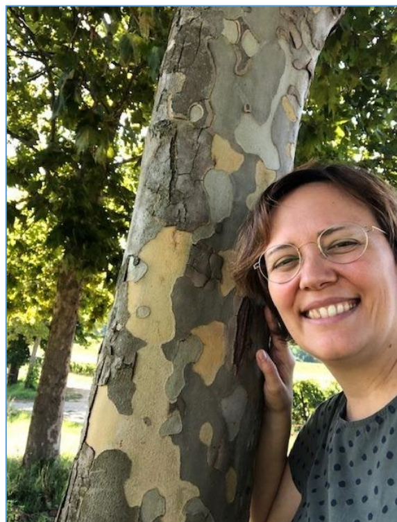
Figure 3 Student and tree. An example of place awareness in a didactic digital environment. Permission was given to share the student photo.

These encounters were open to students' exploration and discussion, but could also be reflected upon in relation to their own connections with nature, which they shared in a place-based lesson at the end of the course (see Fig. 3).