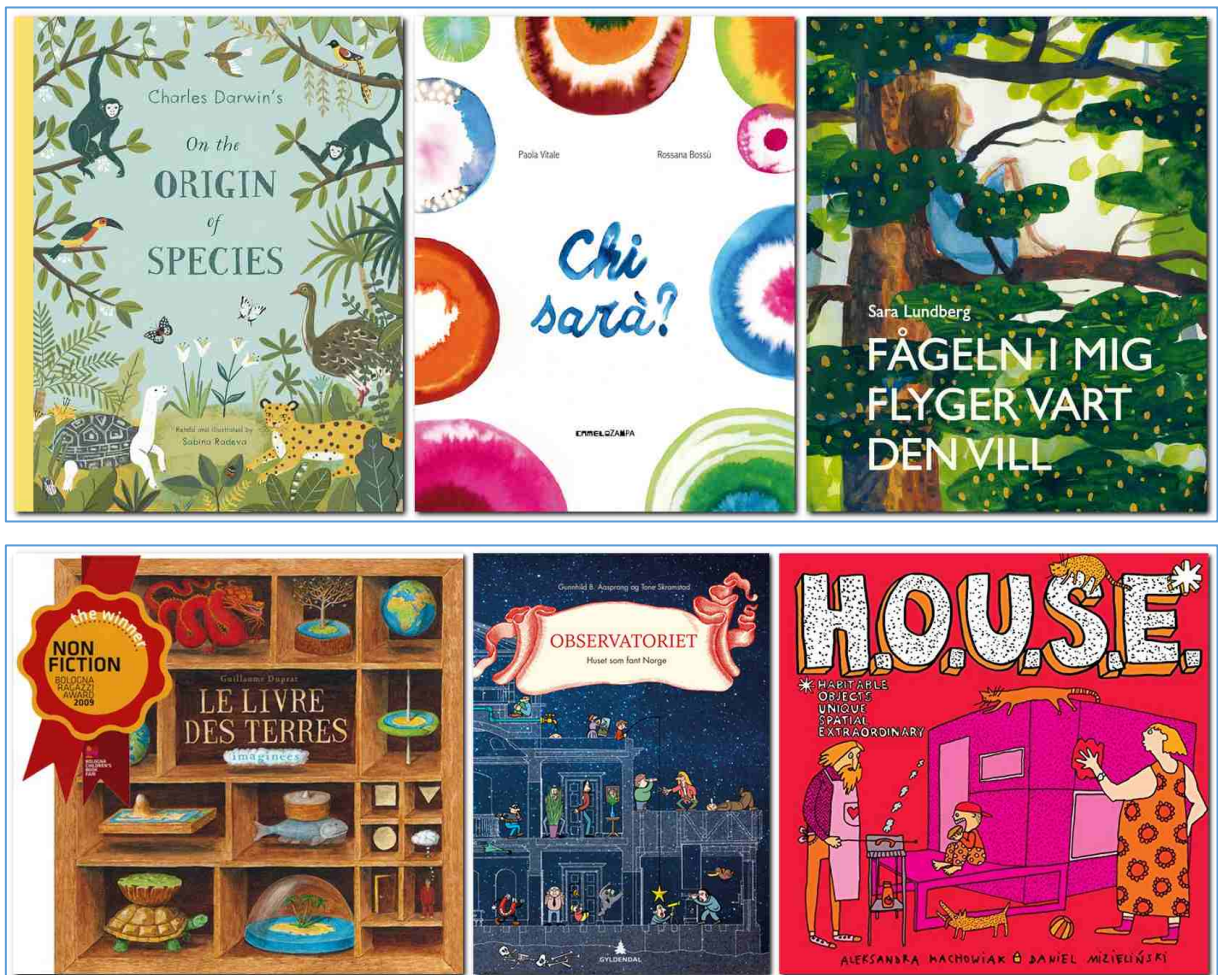
Figures 1a and 1b. Covers of some of the selected picturebooks.

Expertise in the sphere of visual and aesthetic literacy is closely connected to the capacity to read, understand, interpret, and use facts and figures to create knowledge, and to appreciate harmonious forms and innovative modalities of verbal and visual strategies in nonfiction picturebooks (Goga et al., 2021). This is the reason why we paid a great deal of attention to the selection of the nonfiction picturebooks for our course. We selected picturebooks that could provide students with a more articulate and critical relationship between picturebook theory (Kümmerling-Meibauer, 2018), aesthetics and science and at the same time foster their environmental awareness. Therefore, we chose nonfiction picturebooks with very diversified shapes and graphical solutions (see Figs. 1a and 1b).