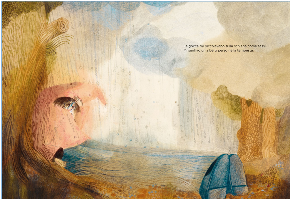
Figure 2. Un grande giorno di niente (2016) by Beatrice Alemagna, Topipittori. Reproduced with permission.

These encounters were open to students' exploration and discussion, but could also be reflected upon in relation to their own connections with nature, which they shared in a place-based lesson at the end of the course (see Fig. 3).