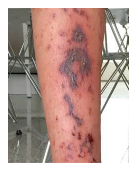
Figure 1. Necrotic lesions on the right pretibial region.

The patient also reported the onset of hypoesthesia of the first three digits of the left hand associated