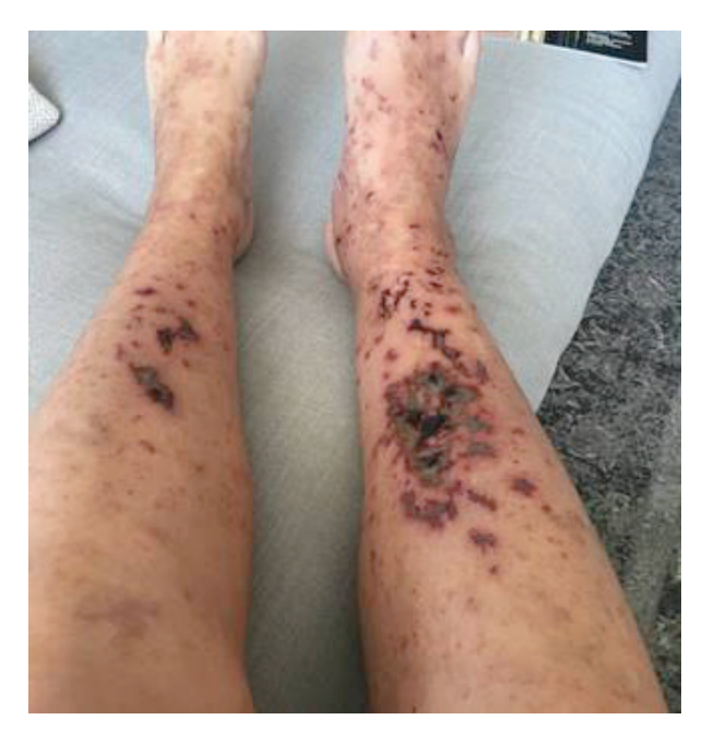
Figure 3. Necrotic hemorrhagic evolution of the lesions of lower limbs.

with stiffness and tremor. She also reported hypoesthesia on the lateral side of the left ankle and foot, as well as widespread arthromyalgias. Thus, electromyography and electroneurography (EMG/ENG) of the upper and lower limbs was performed, but resulted negative.