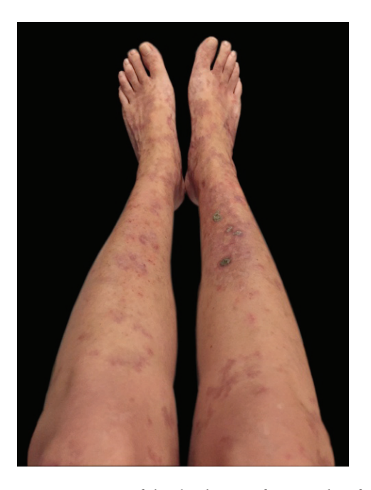
Figure 4. Improvement of the skin lesions after a single infusion of IVIg (2 g/kg).

The treatment of LCV depends on two major factors: the etiology and the extent of disease, especially in the cases of a systemic involvement. When LCV is the manifestation of a systemic vasculitis process, the