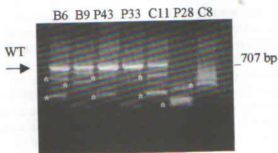
Fig. 1. Results of the reverse transcription polymerase chain reaction analysis of FHIT transcripts. The arrow shows the normal-size transcript (707 bp); asterisks indicate aberrant transcripts of the FHIT gene. Lack of normal FHIT expression is seen in tumours C8 and P28. WT = wild type.

Sequencing analysis showed that additional bands were FHIT transcripts lacking one or more exons with junctions precisely at the splicing sites. The abnormal transcripts were more frequently deletions of exons 4-5-6 resulting in the junction of exons 3-7, deletions of exons 4-5-6-7-8 resulting in the junction of exons 3-9, and deletions of exons 5-6-7 resulting in the junction of exons 4-8. We found only one case of an insertion after exon 3 of a 97-base sequence; a BLAST search of the GeneBank database showed a significant homology (78%) of 29 bases of the inserted sequence with the varicella-zoster virus sequence.