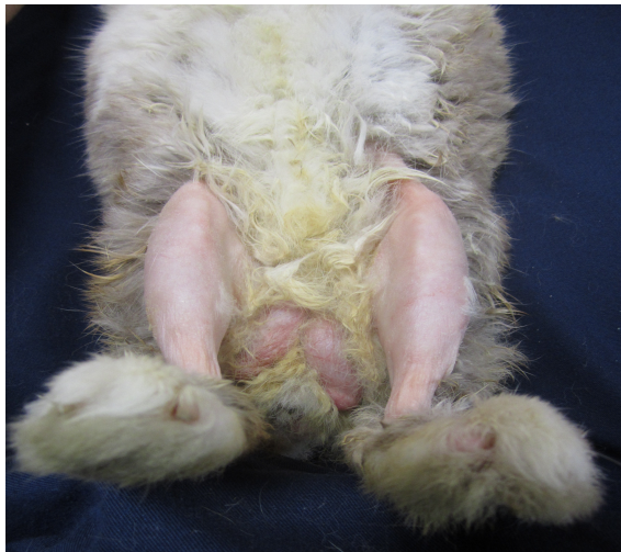
Fig. 2: pet rabbit with obvious signs of perineal dermatitis caused by poliuria and incontinence