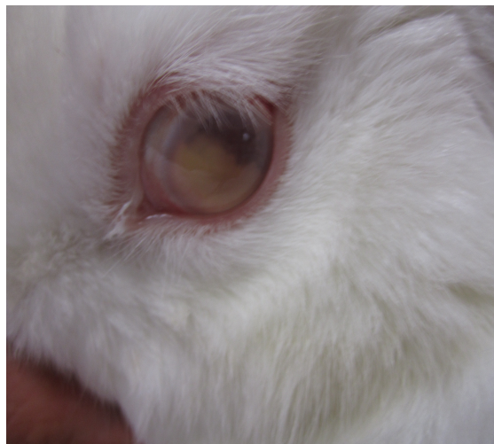
Fig. 4: advanced stage of phacoclastic uveitis in a pet rabbit