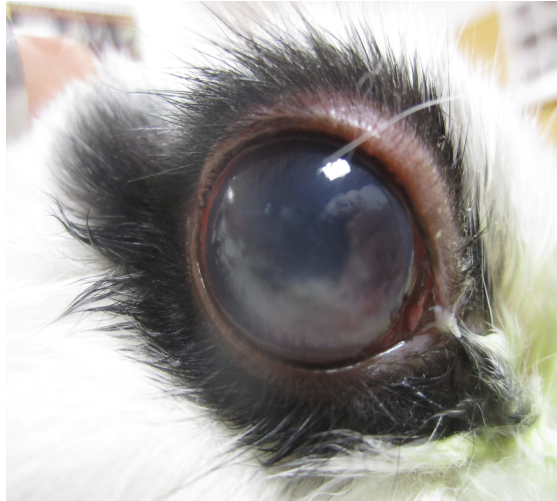
Fig. 3: initial stage of phacoclastic uveitis in a pet rabbit