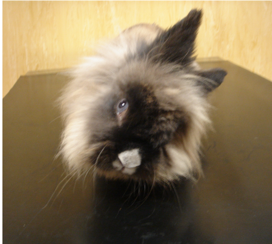
Fig. 1: pet rabbit showing moderate head tilt