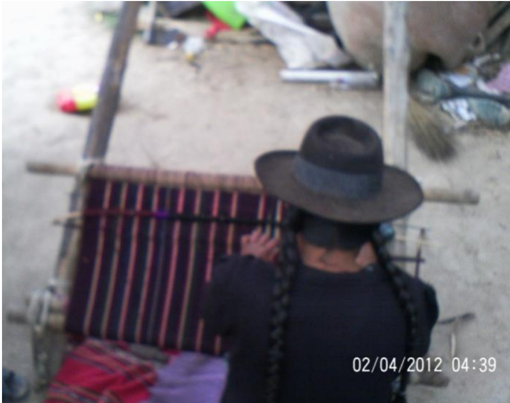
Photograph 26: “...Here my mom is woven using colors that we like more, painted wool with organic material, and do she weaves wool, would be nice to show these tissues or going to sell, they could pay us well, but there is no way to go city and go, is expensive and far and no transport..”

so competitive. The chosen photograph shows how participants wanted to express the elaboration of the tissues in the traditional way and original local materials. (Photograph 26).