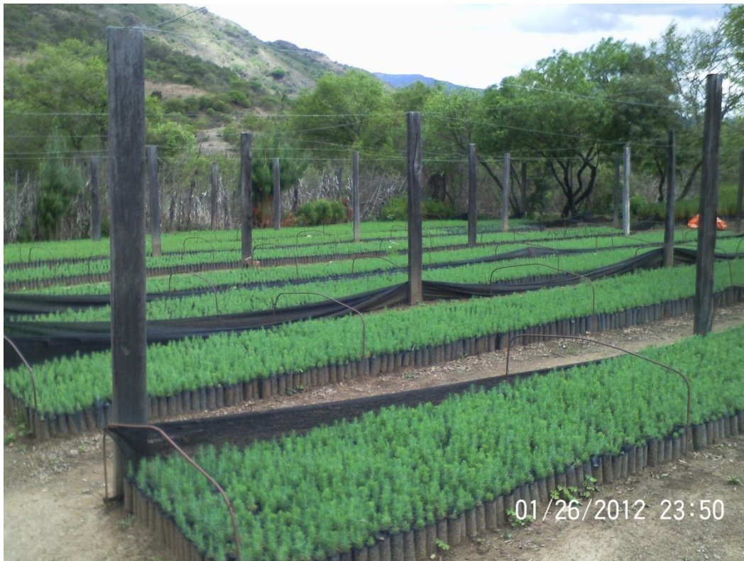
Photograph 19: “...our new gardens are thriving dedicate myself to keep, all must dedicate ourselves to keep them alive to have to have a nice prairie instead of this dry plain, is the most important for us and the children have to learn with us to look after the nursery and planting trees...”

One of the most important issues for participants, not only for the attributed value they say they have learned from NGO and cooperation agencies, but because they are convinced of the strategic value that have Greenhouses for the future of this region. In this subcategory, participants told stories about seeing their future with a forest, to start the timber business as a long term community intention even if they would have to wait so long to see the results, in line with this, they spoke about the fact of the importance of having their children taking care and learning from the garden greenhouse. They chose the picture to represent their future and one of the most important issues for all community benefits and development. (Photograph 19).