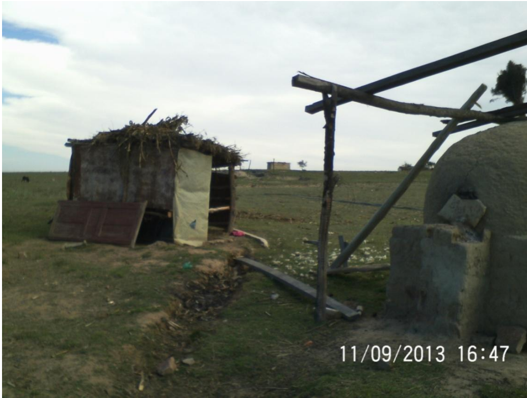
Photograph 14: ".....We bath outside the house but not much because serves water and we have no sewer pipe for drainage .... would like to have a bathroom around the house more"