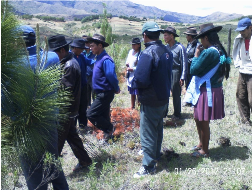
Photograph 23: “...If we organize ourselves we can do improvements performing anything, the nursery may be something that we either travel exchange forest but lack both learn regain our solidarity and then have good leaders we need to learn as a community organized..”