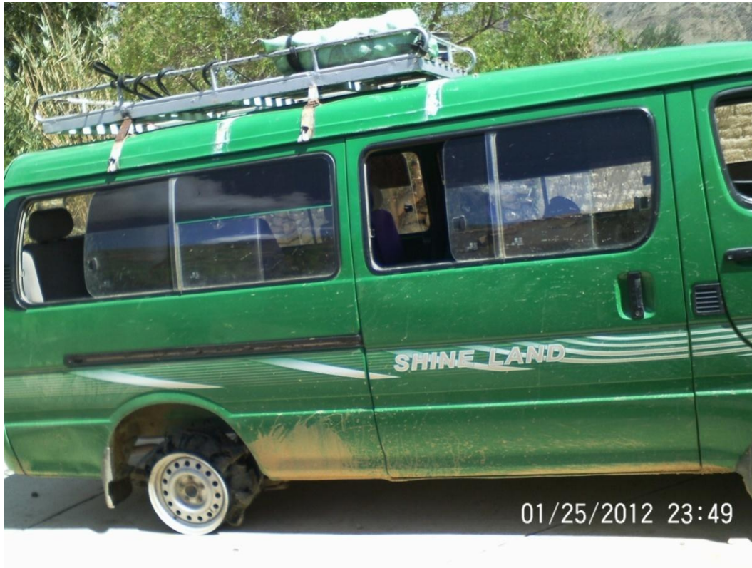
Photograph 2. “...It could be improved this road since cars, always break here , we don't know how to help to fix them....”