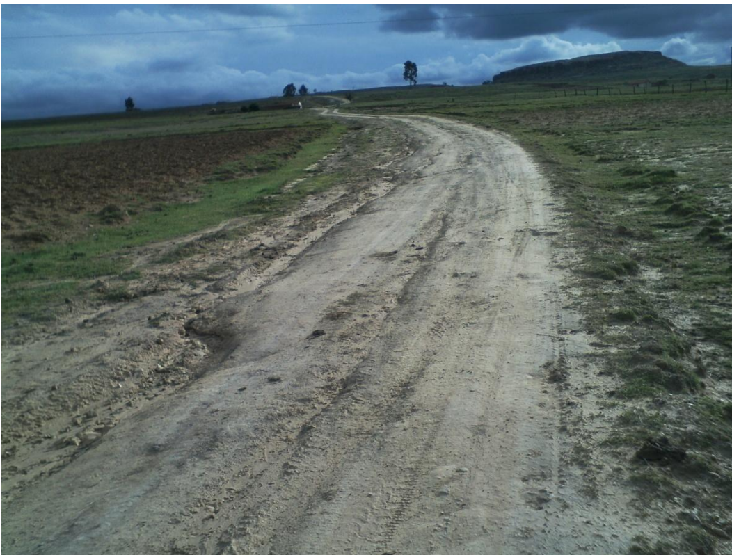
Photograph 1. “...I would like to improve the roads so children can arrive safely and on time to school and non-costly way to school...”

All participants have referred that the fact of having poor access through the road, the fact that there is not even a regional road to connect Aramasi with the rest of municipalities, makes extremely difficult even to have any kind of activity to integrate it into the reality of the Presto's municipality or the region of Zudanez, and loses the opportunity to make a profit out of being part of a region that is known as a very traditional touristic area because of its historical importance. Participants emphasized in the loss of touristic opportunities that would probably bring more people to invest and help to develop the community. Participants chose these photographs because it shows exactly all the real conditions of the road (Photograph 1) and how tourists and public automobile break in the road (Photograph 2).