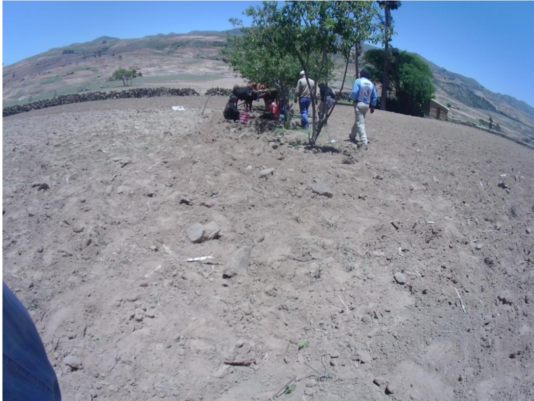
Photograph 24: “...la solidaridad es lo que caracteriza a Aramasi, todos nos ayudabamos tanto antes, ahora estamos perdiendo esa costumbre de trabajar juntos para que nos vaya bien a todos ... ese tipo de rabajo del Ayni se esta perdiendo...tenemos que recuperar y empezar a ayudarnos otra vez”