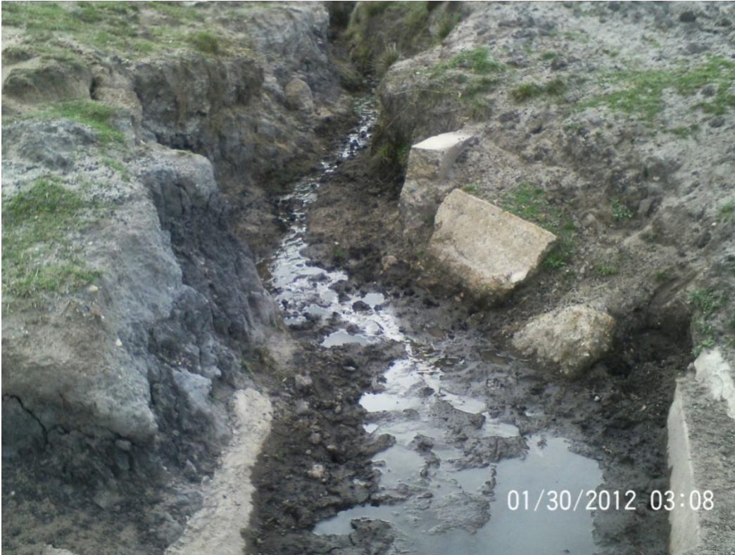
Photograph 15: "...When it rains, water that accumulates is not enough to wet the soil and water and run through the holes and not left on the plants and these do not grow .... the floor is hard .... it's like cement the soil...."