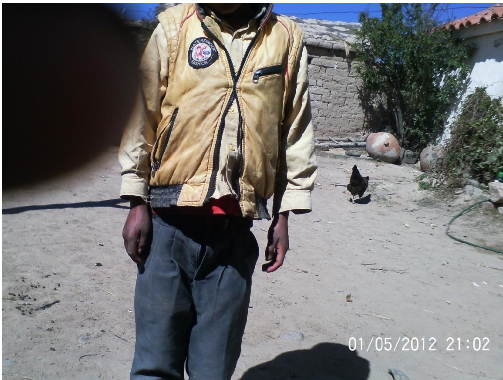
Photograph 21: “....My son is always sick, and I have not have the chance to take him to the doctor because he does not come here permanently...seems sick me for several weeks because she have nowhere to go, no medical center or nurse, just to put vaccines and come back after a month.”

Under this topic they discussed about the fact of being marginalized from the medical system, they consider that it is not fair at all not having a medical staff assigned only because there are few people to consider the need of a community of having medical attention or at least nursery attention. They talked about the difficulty of taking their children to the other nearby town or waiting for the visit of the doctor and the nurse that come to Aramasi once a month and there are not medicines available in any case, Health care center and pharmacy are always closed, except the das doctor and nursery come. They chose this picture to show the conditions in which some children have to wait until doctor comes after a month, and that they need the attention, the picture shows that children need all services, specially medical ones. (Photograph 21)