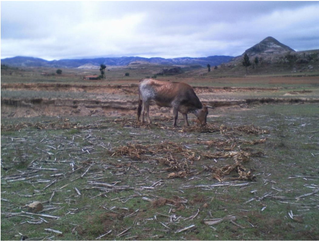
Photograph 10: ".... You cannot find or for animal feed, are not skinny and have little cow's milk, we have to buy alfa-grass to eat and is very expensive .... and we find fuelwood to cook, there is almost nothing only roots dry up and thorns, but that is not good fuelwood.....it gives so much fume at home"