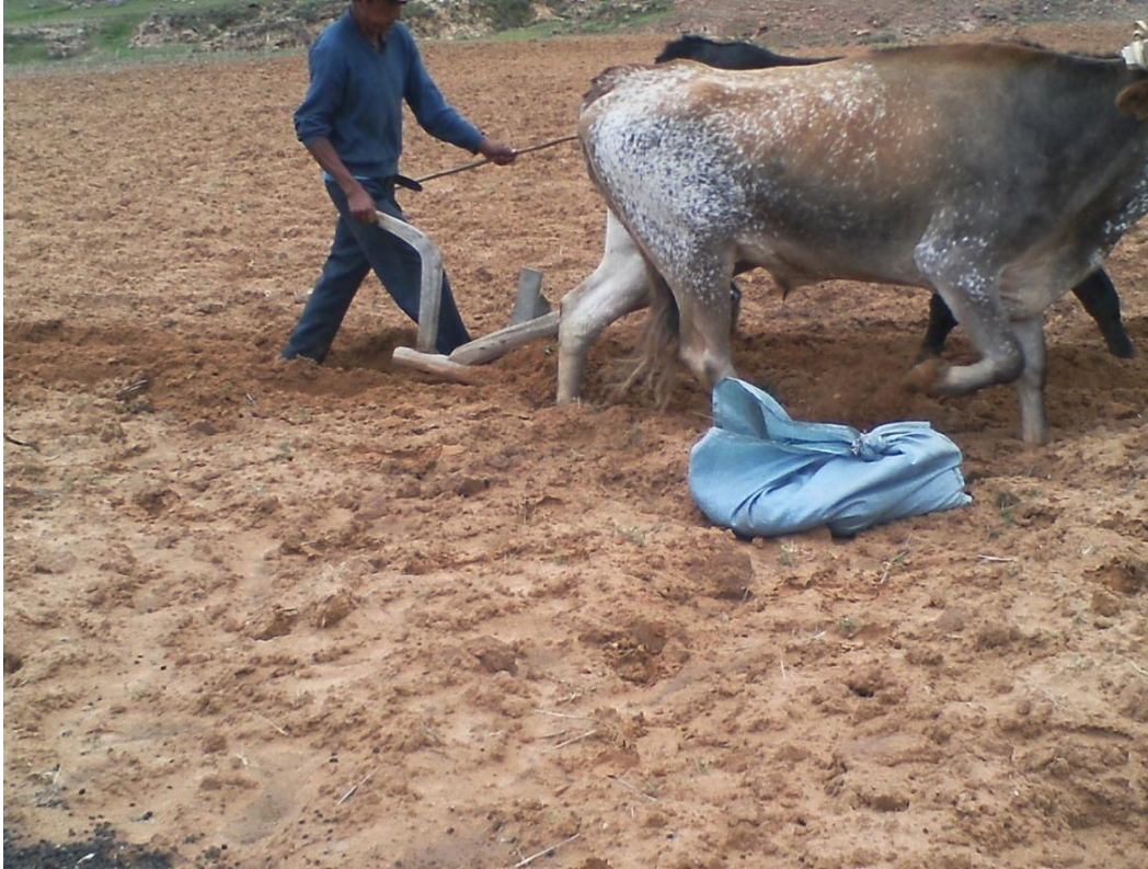
Photograph 11: “...”... It would be nice to have equipment because the work is very heavy hand, but do not have economic possibilities, nor can we do to bring the tractor .... no way they would like to learn to drive tractor and learn how to raise my mjor animals, have more cattle hand ..... for now with plow ...”