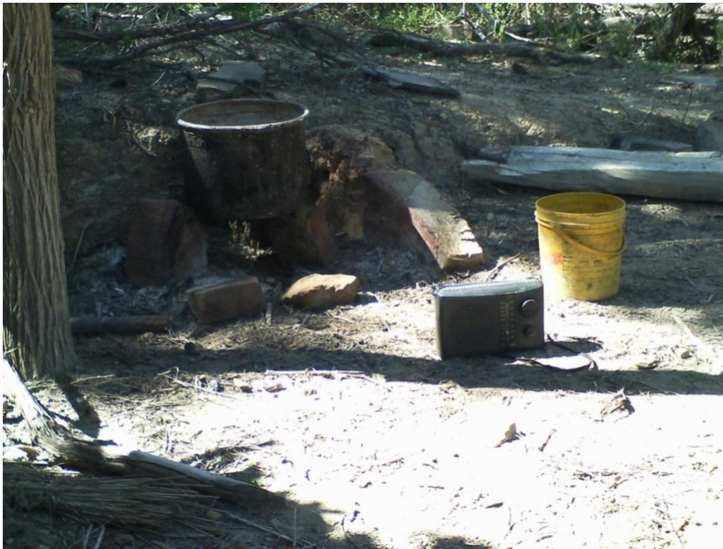
Photograph 17: “our homes are uncomfortable, because we cook on the patio inside the house is very small and smokes a lot, there is nowhere to sit and eat, we sleep in the same place....”

In this section the stories were particularly regarding conditions of discomfort you have in your home, a theme often repeated in each session, they gave an account of the conditions in which they live have to improve in general, it is not healthy to live without bathrooms without windows, without being separated from the animals, many people live sharing a single room and much more without much clarity as to organize their homes inside so there is less discomfort, having the kitchen was very uncomfortable because lena type with that feature (thorns) causes a lot of smoke and not allow them to breathe if they had s within the kitchen. They chose the photography and the inconvenience and precariousness in which they live and their children were documented accurately. (Photograph 17).