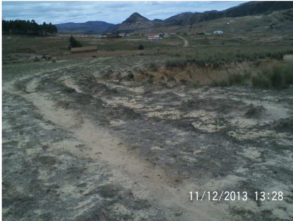
Photograph 5. “...Solitude is Aramasi, no fairy, no streets, no light no nothing, no streets, no services, only a few houses in the middle of nowhere ... I wonder when we can have all the things in other places”