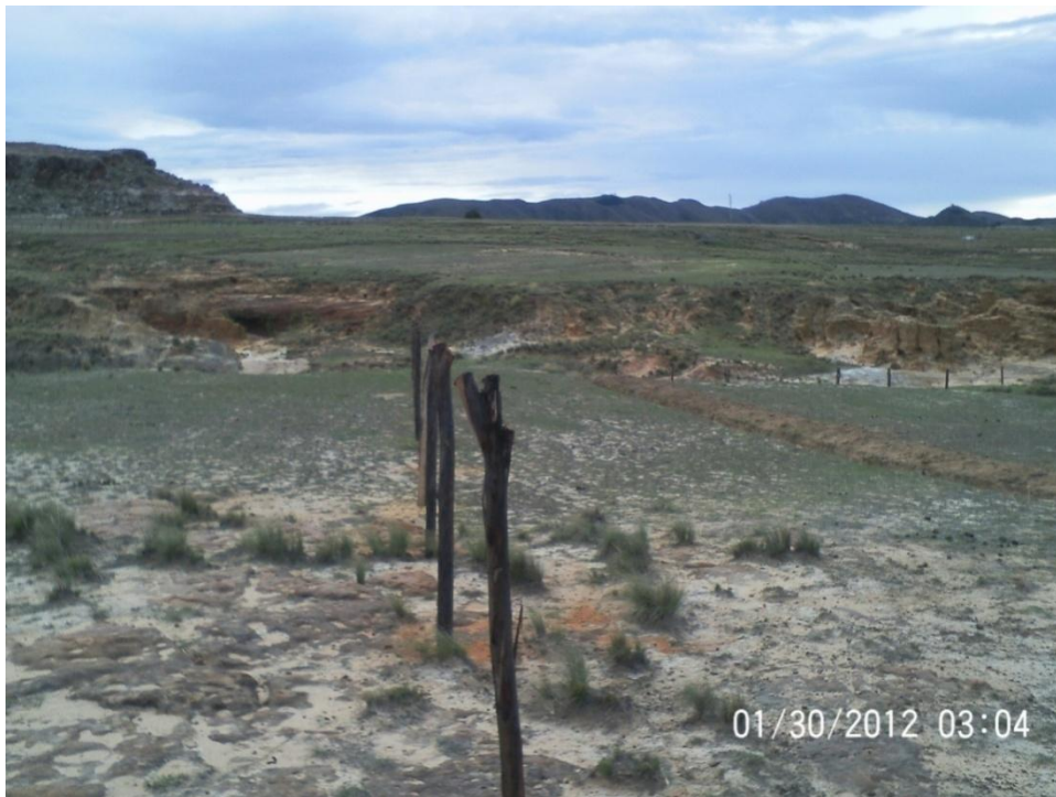
Photograph 7. “...I really like this plateau....I was borned here and I enjoy it, but I wish it had grass, and plants...then I would like it even better”

Critical dialogue in this subcategory was about liking the plateau as a fundamental characteristic of the region, and all participants expressed that it is part of their identity and that they really enjoy looking to the plateau, it has been part of the community identity, nevertheless discussion also pointed that the fact of not having trees makes the place inclement because of the wind or cold or sun that kills any kind of improvement, what was really valued by participants is the fact that being in a plateau geographically makes part of their identity but the plateau should be forested or at least become a prairie. They chose a picture of the plateau because they thought it makes part of their identity. (Photograph 7).