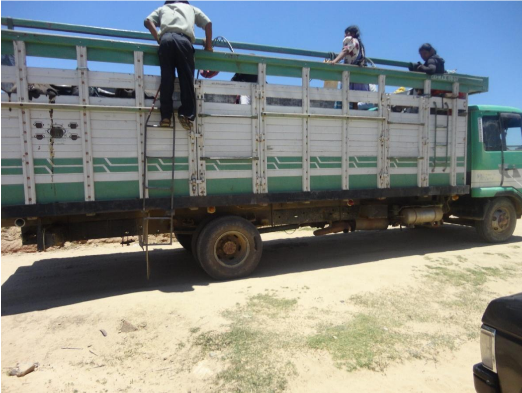
Photograph 3. “... I wish I could sell my cows at a good price and not have to accept the price of the carrier...”