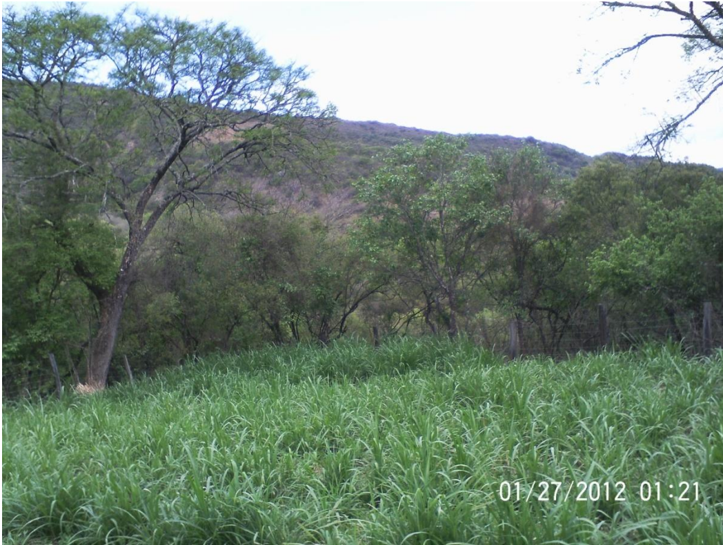
Photograph 9: “...Now that we are in the course of exchange of experiences in Sopachuy, I brought my camera and I'll take pictures to see how it should be Aramasi, we have to dedicate ourselves to have life .... we will plant trees .... I to work and maintain nurseries for Our flatness revived. ”