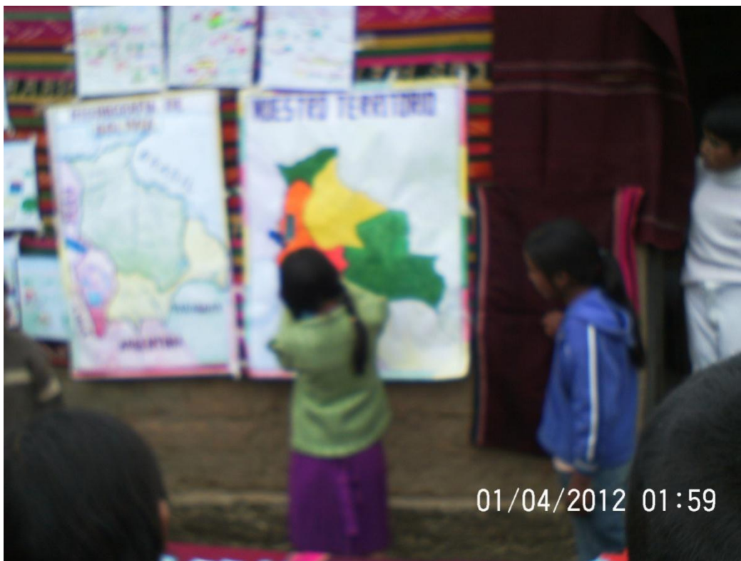
Photograph 20: “ ... t school there are much better environments, children are out and not safe to leave them there because they spend class outside to see better in the absence of light must be improved .... school is the best we have”

The contents referred under this category are all of those that people mean of being concern about school conditions, about children being in very precarious conditions to study and to learn what school teachers, but also not having the opportunity to keep them until they finish school since there are not medium and high school levels and there is a clear interruption in the schooling of this children because they also have to start working with their parents, the discussion about this topic were of so much concern of the future of their children because they see them so limited and do not want them to reproduce poverty, limitation, exclusion and marginality as them. They chose this picture to show how children study outside of the school classroom because inside there is no much of a light. (Photograph 20).