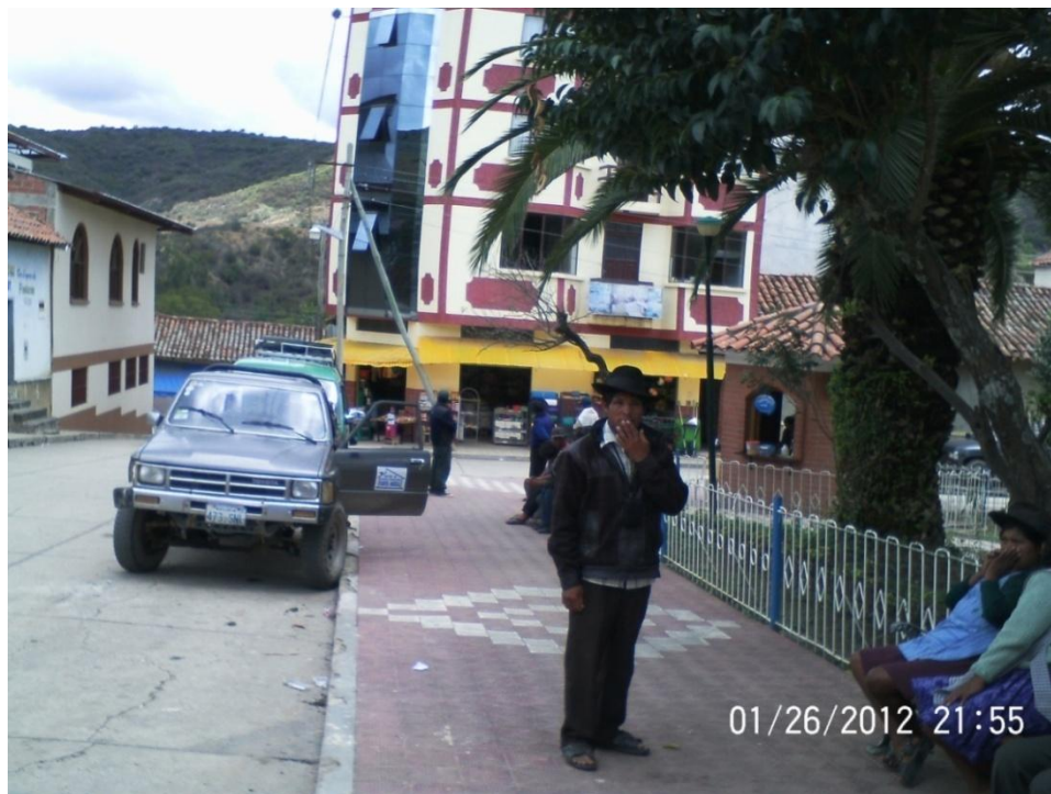
Photograph 6. “...I want Aramasi would have concrete streets as here in Presto...it would be nice to have electricity as well...”