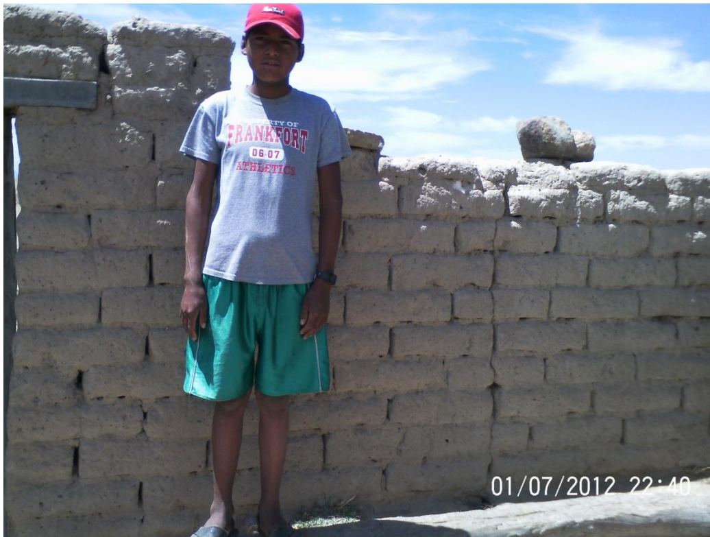
Photograph 22: "...My son is going to have to look for work outside Aramasi, because here there is nothing, no Future for, might have future with trees and forest for res tal ves for grandchildren

This was a real important concern among group discussion, as part of this category there were opinions about young people and compete families emigrating or as part of migratory itinerant process, in other words people who live out and in Aramasi in dependence of the period of the year, specially man, children growing without a parent or living in certain periods of the year by themselves because parents have to go and find an economical solution to poverty and production. Participants analyzed the future of Aramasi considering the great possibility of having all young man to emigrate to continue to study or work since education does not have good conditions. They chose this photograph in order to reflect about young teenager that would have to emigrate to study and will not produce and learn more about reforestation project or Aramasi. (Photograph 22).