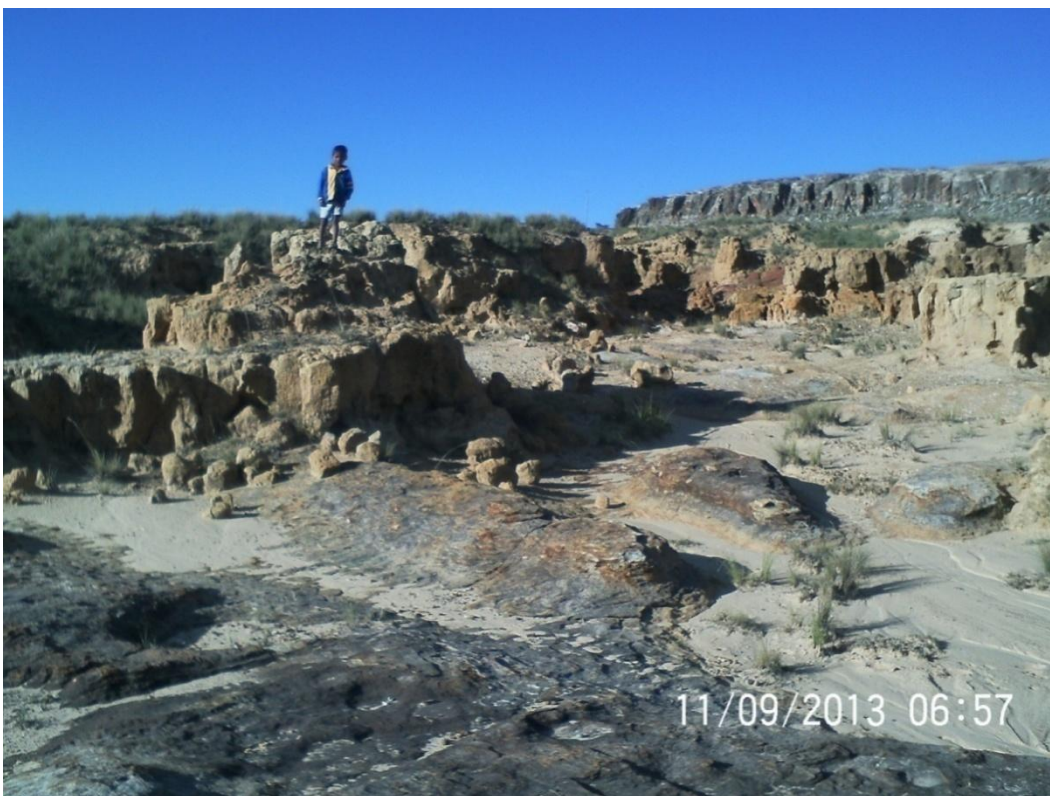
Photograph 8: “...This seems to be no man's land, dry and can not do anything for now, has dried up, no trees and that takes away life, I have no desire or see .... is very dry and the animals survive here ....”

Participants reflected about the serious situation of living in a drought place, all stories told about the difficulties which people in Aramasi community have to go through, these difficulties have to do with the fact of living with the sense of a plateau dry as death, to feel the inclement weather and whipping wind at the lack of a natural organic curtain and shade produced by the trees; a forest at least would protect the plants, people, houses and animals from the cold and frost processes . This subcategory shows all concerns about living in very difficult conditions because of the weather, without green spaces to motivate life. Participants referred about the lack of motivation to live there and even to take pictures of a space of dry land. As a result of it they talked of it as a priority about the development of forests and tree planting in order to plan a reforestation as a long term solution for development, but in order to do so, they are also concerned about learning how to star and continue a soil conservation and reforestation. Participants chose the photographs to show the differences between how drought is Aramasi now (Photograph 8) and how they wish it to become after introducing reforestation plan (Photograph 9).