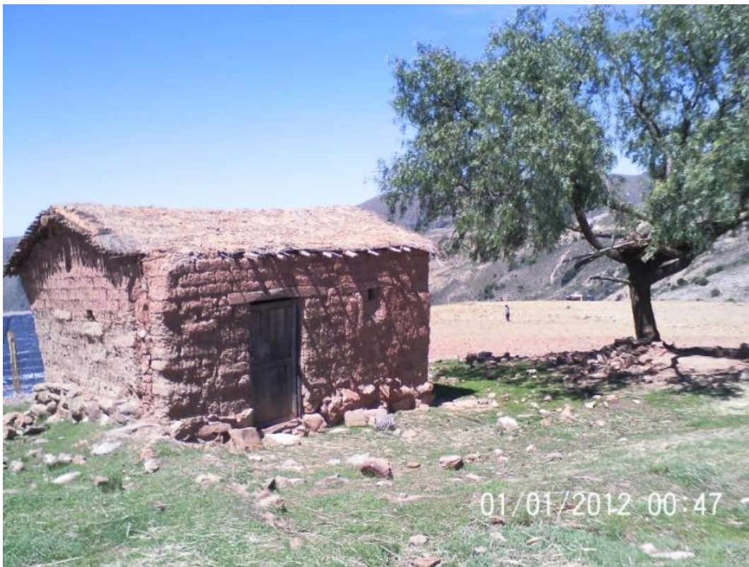
Photograph 16: “... If we could build houses well planned and carried out as a family and we could have good living conditions, bathrooms and sanitary facilities in our own homes . Having access to a bathroom in the house....I want a good stable with corrugated roof and this stable home to live well ... ”

The stories built by the participants about their houses pointed out strongly on the issue of the stability of roofs and walls, quality labeling it item material wears and allows leaks, unstable material such as local material is the only thing what can be very difficult to access the transport of bricks, tiles and calamine. The walls of their houses are made of mud and wood with straw roofs, report that are not waterproof materials and much less hot, the windows have no glass that could be used against the wind. The chosen photograph was taken to explain the conditions in which they live and they wanted change. (Photograph 16).