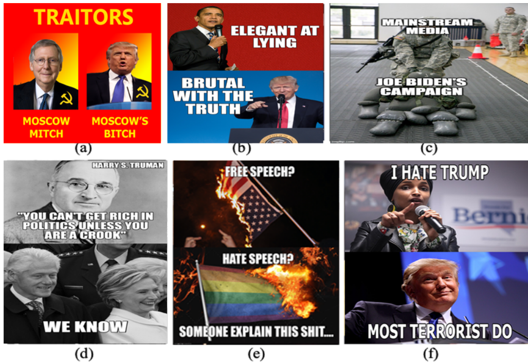
Figure 1: Examples of memes from our dataset. Image sources: (a) 1, (a) 2; (b) 1, (b) 2; (c); (d) 1, (d) 2; (e) 1, (e) 2; (f) 1, (f) 2; Licenses: (a) 1, (c), (d) 2; (a) 2, (b) 2, (f) 1; (b) 1, (f) 2; (d) 1; (e) 1; (e) 2

Memes are popular in social media as they can be quickly understood with minimal effort (Diresta, 2018). They can easily become viral, and thus it is important to detect malicious ones quickly, and also to understand the nature of propaganda, which can help human moderators, but also journalists, by offering them support for a higher level analysis.