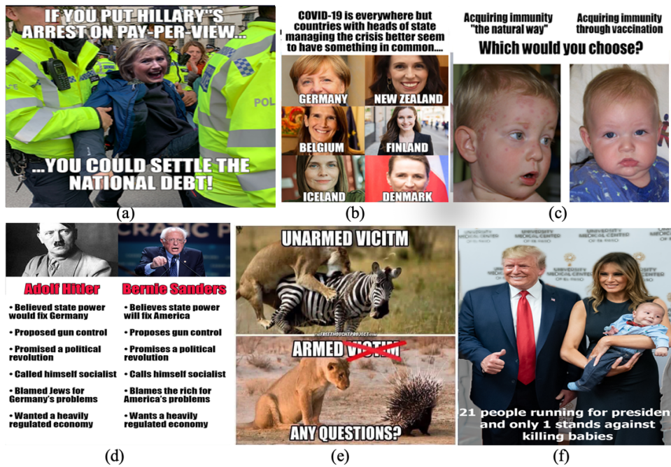
Figure 4: Memes from our dataset. Image sources: (a) 1, (a) 2; (b) 1, (b) 2, (b) 3, (b) 4, (b) 5, (b) 6; (c) 1, (c) 2; (d) 1, (d) 2; (e); (f); Licenses: (b) 6, (c) 1, (f); (a) 2, (b) 1, (b) 5, (c) 2, (d) 1; (a) 1; (b) 2, (b) 3, (b) 4, (c) 2; (e)