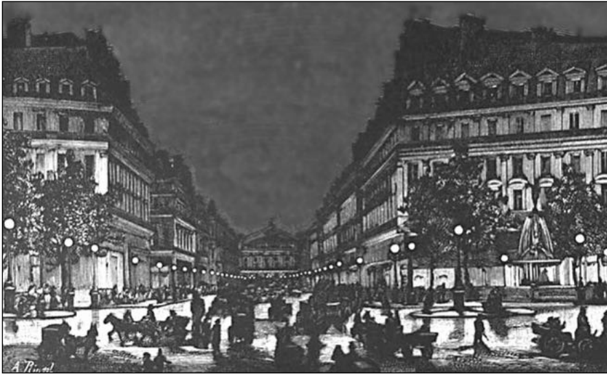
FIGURE 3 – Electric lighting with Yablochkov's candles along the Avenue de l'Opéra at the 1878 Paris Exposition. It triggered a boom in gas utility stocks.

models), the Yablochkov candle [10]. Its design featured two parallel electrodes set side by side to maintain their distance while consuming, with no need for automatic adjustment (Figure 2). To improve its performance, Gramme developed an efficient alternator in 1878 whose alternating current ensured the balanced consumption of the two carbon electrodes. The same year, the Grands Magasins du Louvre in Paris was supplied with eight Yablochkov candles powered by a Gramme alternator. Similar systems were soon implemented in the Avenue de l'Opéra and the Place de l'Opéra on the occasion of the Paris Exposition of 1878 (Figure 3).