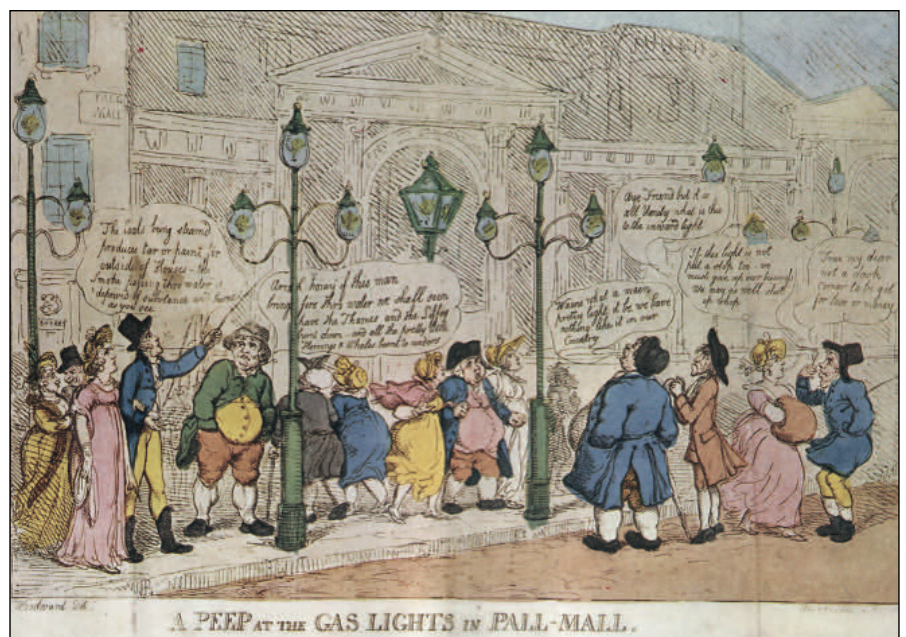
FIGURE 1 – A satirical cartoon showing people marveling at the early public gas lighting in London.

In a few decades, commercial and public gas lighting boomed in many cities in Europe (e.g., France, Belgium, Germany, and Russia) and the Americas (starting in the United States) because of its lower cost compared to conventional oil lamps and candles. The savings was about 75%. Even if gas lamps could