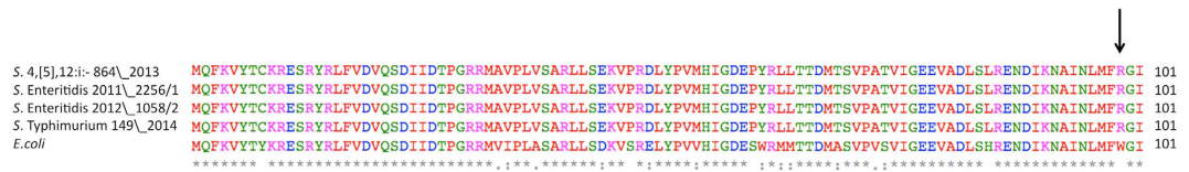
Figure 2. Alignment of the aminoacidic CcdB sequence. The arrow indicates the R99W mutation.

to the subclusters a, b and d. Conversely, serovars Enteritidis and Gallinarum displayed only FIIS plasmids. S. Lawndale and S. Alachua did not display any Inc-plasmid and S. Tennessee was the only isolate found to harbor I1 plasmids. Statistical analysis indicated a significant association between the presence of FIIS plasmids and Salmonella serovars. The occurrence of this plasmid was significantly lower in the Typhimurium and 4,[5],12:i:- serovars compared to the other investigated serovars ( p < 0.05 ).